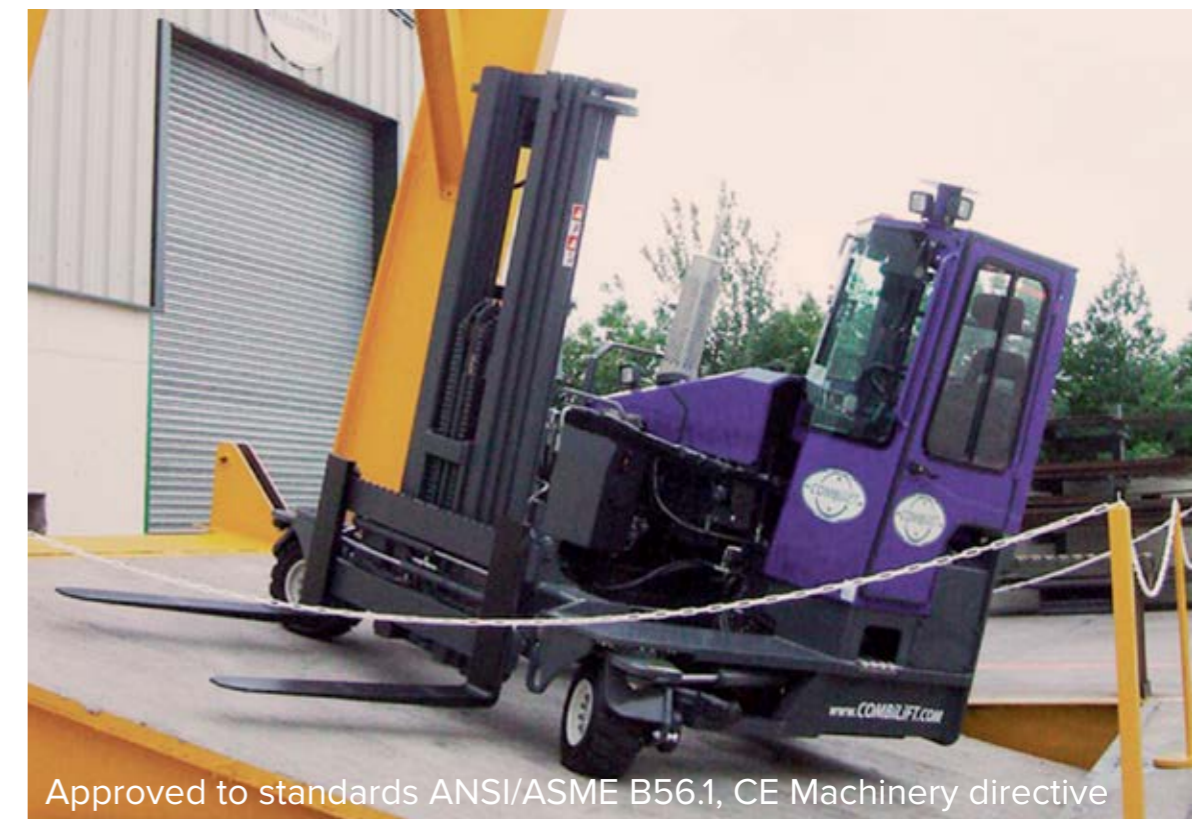
Approved to standards ANSI/ASME B56.1, CE Machinery directive